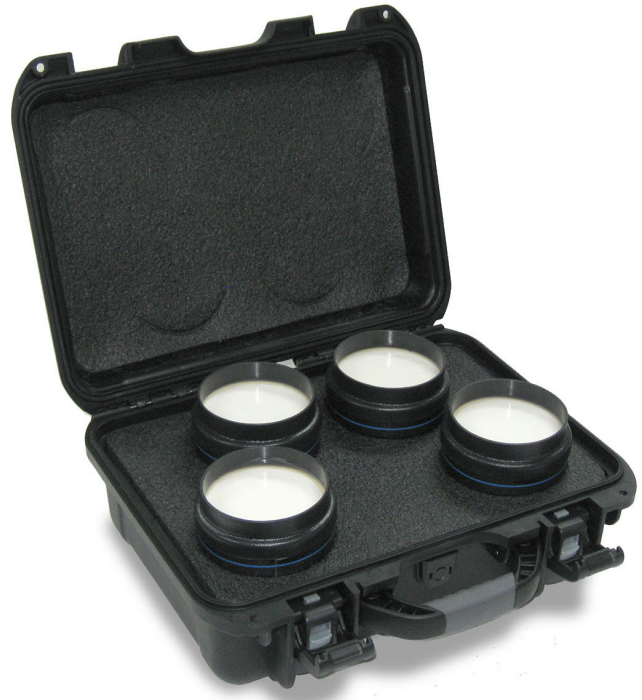
Carry Case included with CIRS Shear Wave Liver Fibrosis Phantoms.