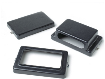
Phantom includes detachable scanning wells and air tight case.