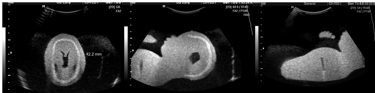
Axial Brain & BPD Measurement