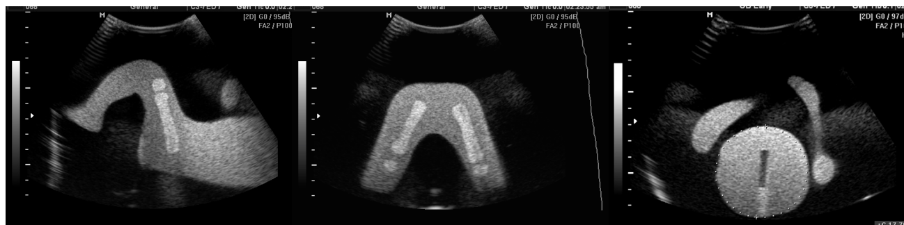
Femoral Length for Measurements