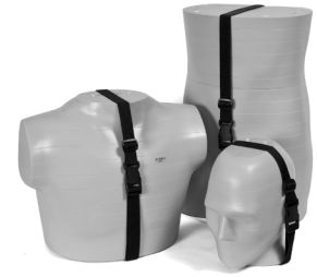
ATOM Head & Neck, Thorax & Pelvis Sections