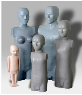
ATOM Models 701-706