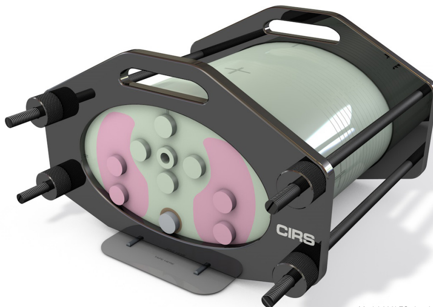
Model 002LFC showing optional water equivalent rod with ion cavity