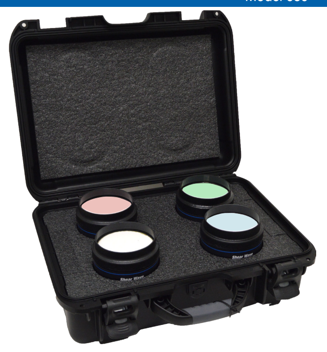
Carry Case included with CIRS Shear Wave Liver Fibrosis Phantoms.