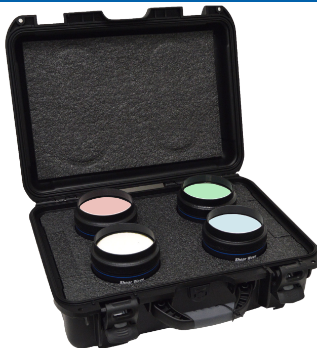
Carry Case included with CIRS Shear Wave Liver Fibrosis Phantoms.