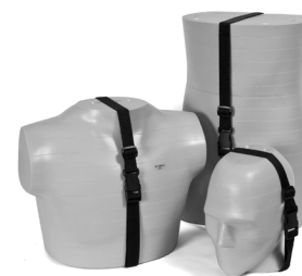
ATOM Head &amp; Neck, Thorax &amp; Pelvis Sections