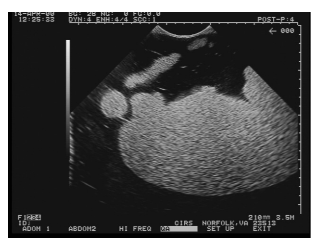
2D Abdominal Profile of Model 065-36