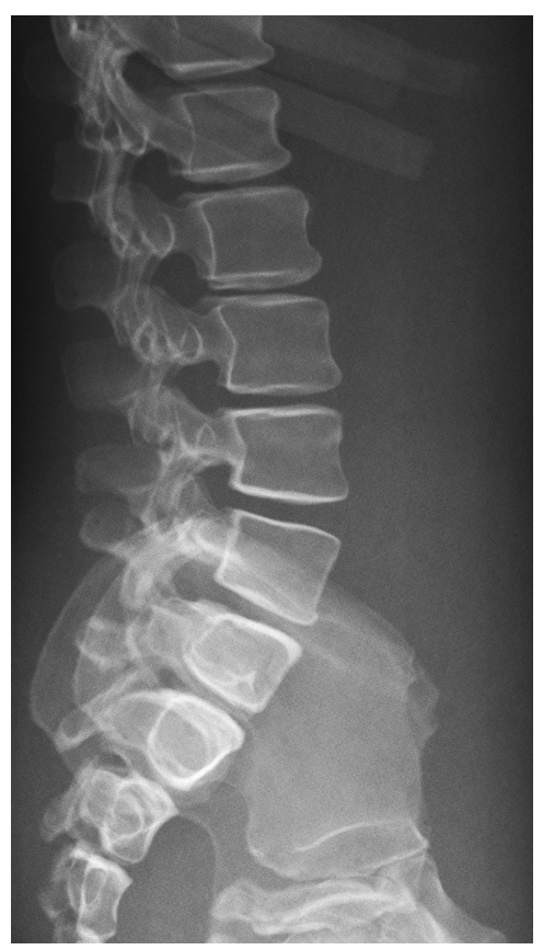
Lateral Lumbar Spine