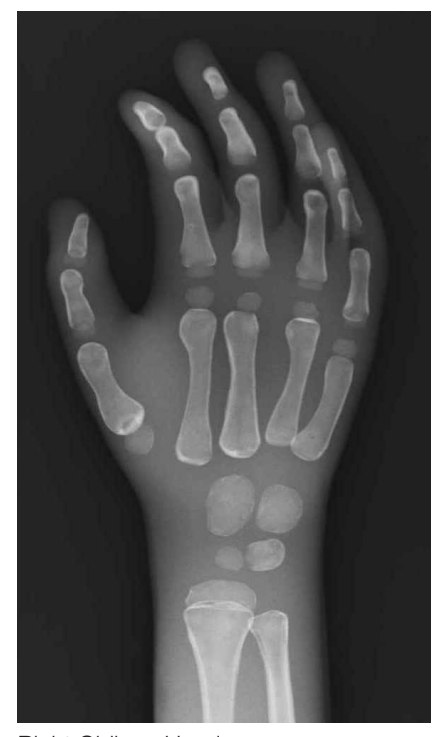
Right Oblique Hand