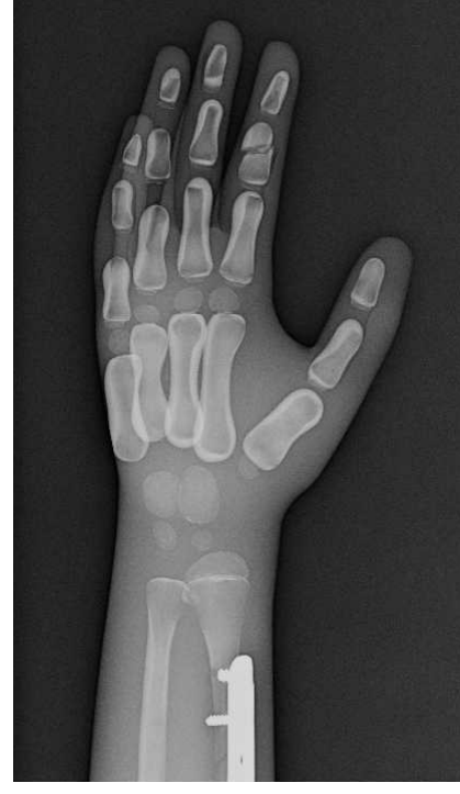
Left Oblique Hand