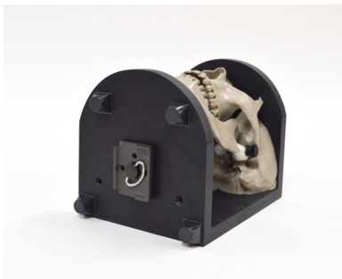
Quick connect plate on PIRATE