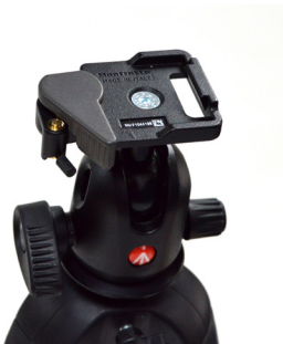
Quick connect on tripod