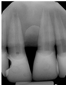
Tooth with a cavity