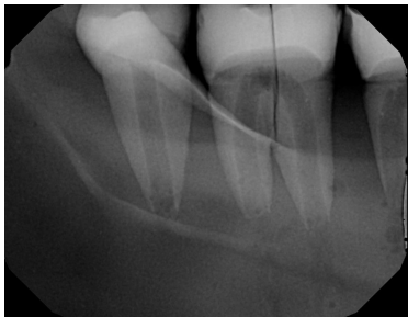
Tooth with a fracture

The suggested use is a basic test protocol. The phantom should be scanned using the same x-ray technical factors as would be used on a patient. Each user of the phantom may find additional uses and CIRS urges to share findings with others when possible and appropriate.